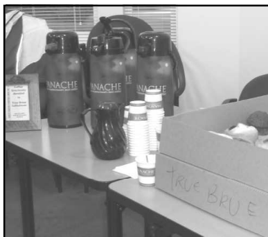
Free coffee and pastries from TRUE BREW