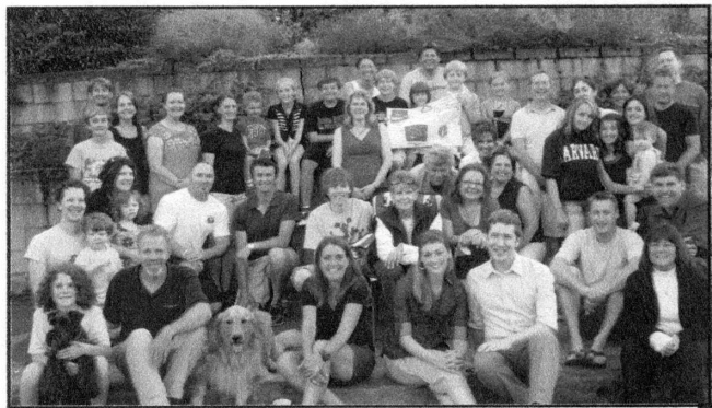
SE Neighbors celebrating their neighborhood.