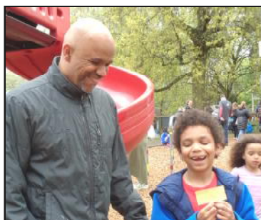
Special ticket winner