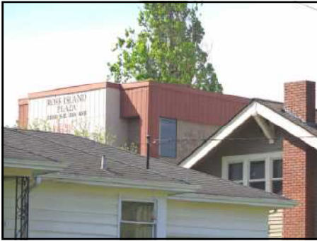
Looking NE from Center St.

Neighbors on 9th Ave. and the BAC received notice in April that there is a proposed cell tower to be constructed on top of the old eye glass building. (8th & Center St.) The size is 10 x 10 ft and 15 ft high. Since there is an existing restriction of 50 ft clearance between residences and cell towers, the city is considering a Type II Conditional Use Review.