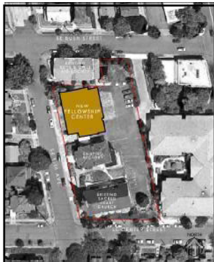
11th Ave between Center & Bush

Over the past 2 years, neighbors and friends of Sacred Heart Catholic Church have raised nearly $1.7 million to build a new Fellowship Hall in the neighborhood. After two years of planning, soliciting funds and working with the city and the Archdiocese, it now looks like it is finally going to happen. This new hall will not only serve parish activities but also be open to neighbors.