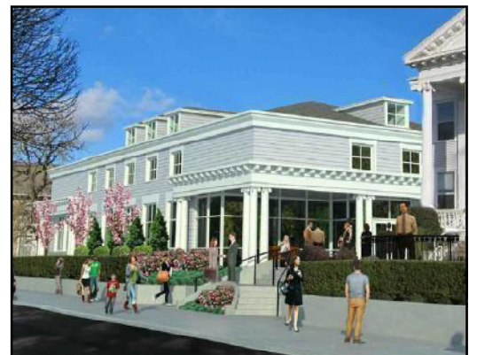
Parish Center Artist Rendition