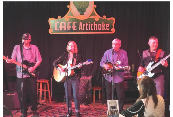
The Martingale Band

For more information, check out www.artichokemusic.org or call 503-232-8845.