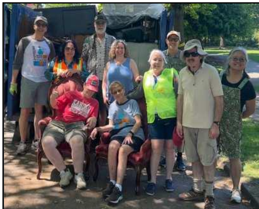
Many of the Neighborhood Crew