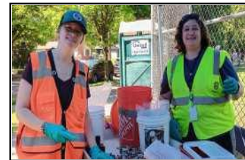
Volunteers from Metro

Thanks to everyone who donated and brought their stuff!